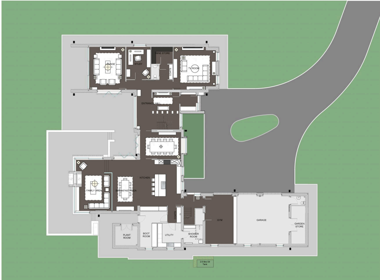
○ GROUND FLOOR PLAN