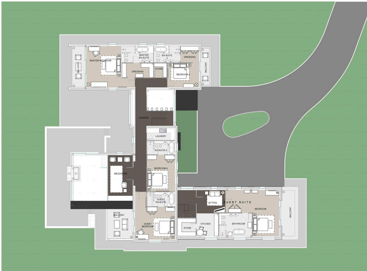
⊕ FIRST FLOOR PLAN